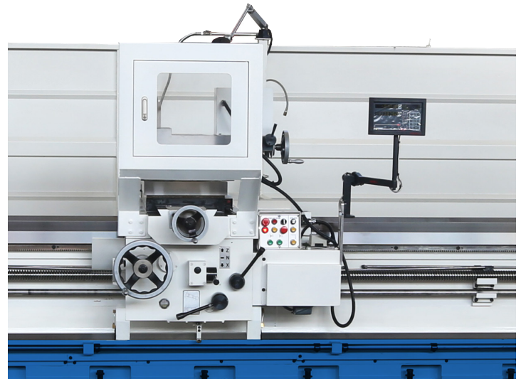
Heavy Duty Carriage shown with optional digital readout

The Big Swing Hollow Spindle Lathes also come equipped with a steady rest, follow rest, taper attachment, and hardened and precision ground bedways. A semi-automatic threading device (optional on some models), front and rear chucks, and many more options are also available.