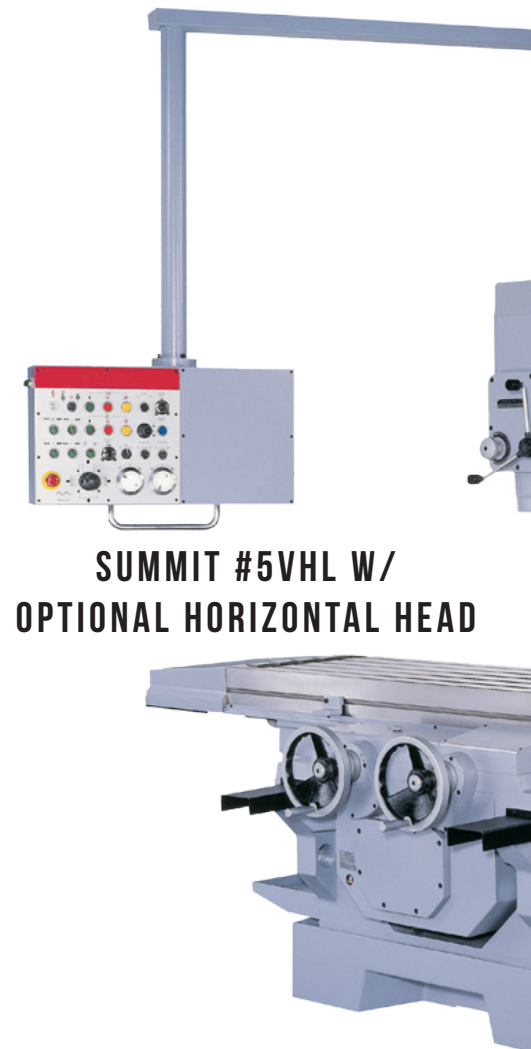
SUMMIT #5VHL W/ OPTIONAL HORIZONTAL HEAD